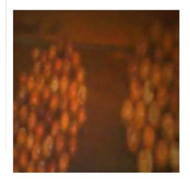
Figure 4: Differences in fruit size of the same source