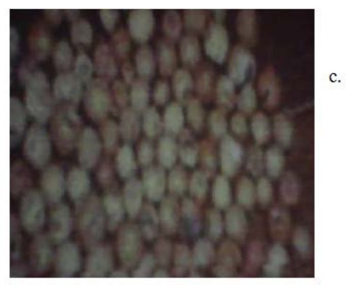
Sinar fruit source