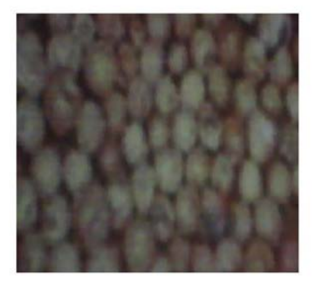
a. Shambat fruit source