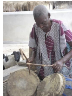
February 12, 2015 in Tutu

The sound of the tam-tam allows contact with these ancestors before the sacrifices. The animals that will be slaughtered according to the fa are the rooster and the ram. The drinks to take are: palm wine, distilled alcohol and schnapps. Whenever the need arises, rites are needed for the protective deities to request the strengthening of their watchful role as shown in the photos below.