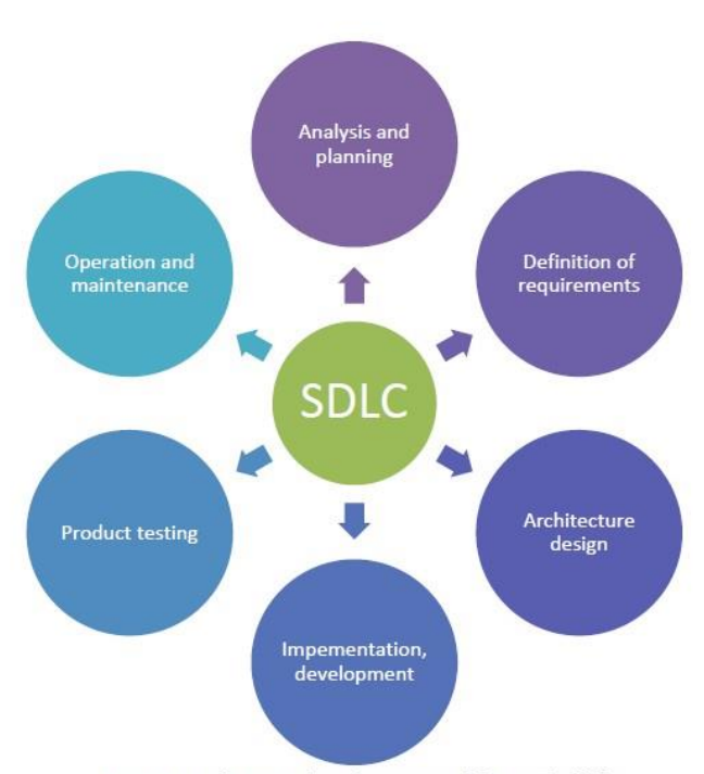
Fig. 1. Software development life cycle [2]

The software development life cycle (SDLC) is used to design, develop, and produce high quality, reliable, cost effective and within time software products in the software industry. This is also called software development process model [1]. Software Development Life Cycle (SDLC) models form the backbone of software engineering practices, guiding the systematic and structured approach to creating high-quality software products. As technology evolves and market demands become more dynamic, software development organizations face the challenge of selecting the most appropriate SDLC model to meet project requirements efficiently and effectively. To make informed decisions, developers, project managers, and quality engineers need a comprehensive understanding of the advantages, disadvantages, and application suitability of various SDLC models in the context of software quality engineering.