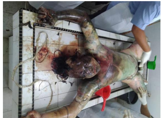
Image 1. Male corpse 40 years old in condition already on decay process.

The male corpse sent by investigator with a letter to request Visum et Repertum. The corpse found inside a room in body condition is supine, covered blood and excrete bad smell. Only the victim stays at that home. The victim is 40 years old based on information from identity card.