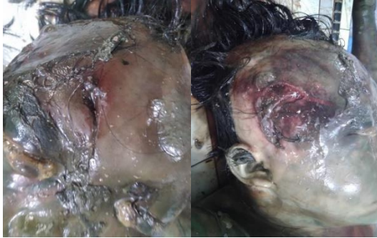
Figure 2. Stab wound on forehead

g. Stomach: looks bloated, there are no signs of violence.