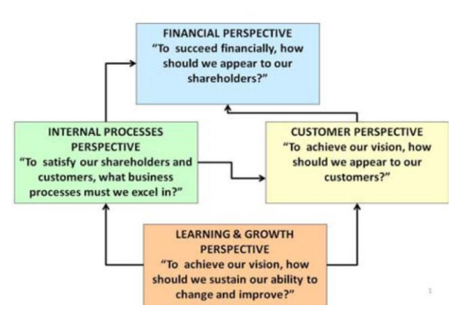
Figure 9.1 shows that a BSC uses four perspectives, namely, Financial, Internal Processes, Customer and Learning & Growth perspective to measure organisational performance. The BSC allows an organisation to set Key Performance Indicators and these are allocated scores and weighting, which are then used to calculate and measure overall organisational performance, as explained by Steyn and Van Dyk (2014:34).

If the regulatory regime uses a Balanced Score Card for the organisational performance management, it is critically important then that a new project evaluation and selection approach and criteria should be aligned with the financial services industry in South Africa. Alignment of project selection decisions with the